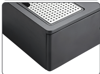
Elegant SOFT CONTOUR Design