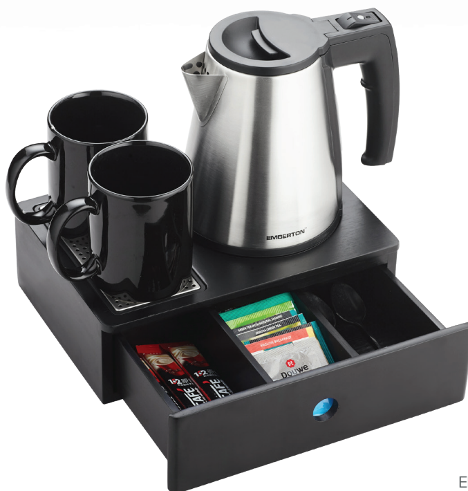
EH50688 (Kettle, Cups & Ingredients not included)