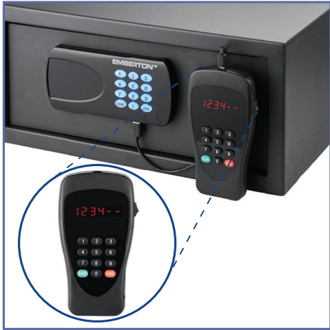
CEU Slot - Optional Audit Trail Reader