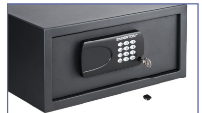
Override Key Included for Emergency Use