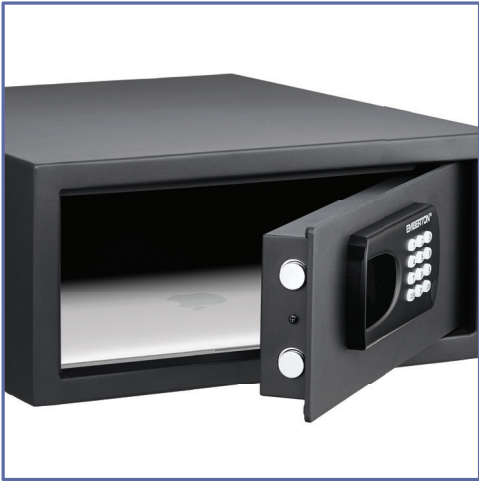
15" & 17" Model is Easy to Store Widescreen Laptops