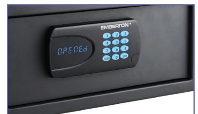
Bright LED Display & Easy to Use Keypad