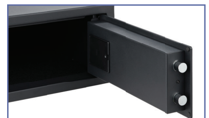
Motorised Locking System